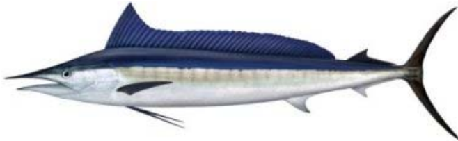
Shortbill spearfish.