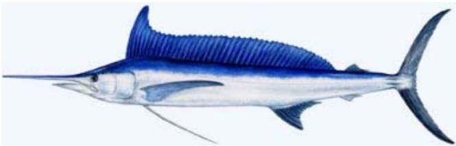
Longbill spearfish. © Diane Rome Peebles.